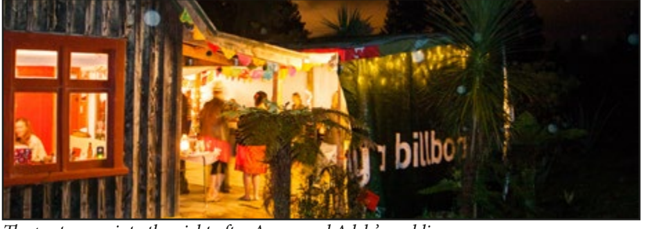
The party runs into the night after Aaron and Adele's wedding