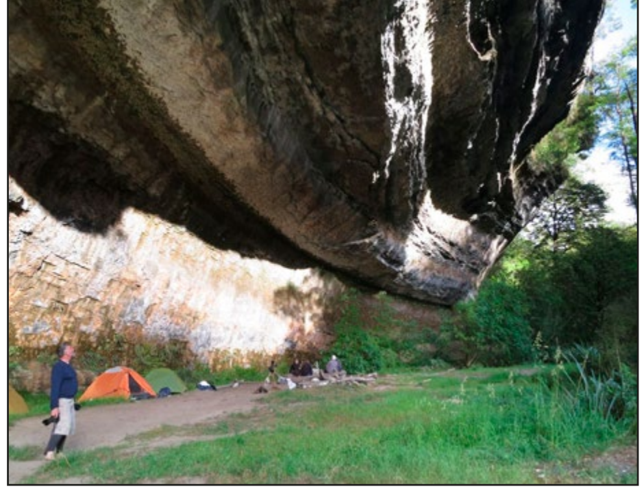
Camp at the Ballroom Overhang