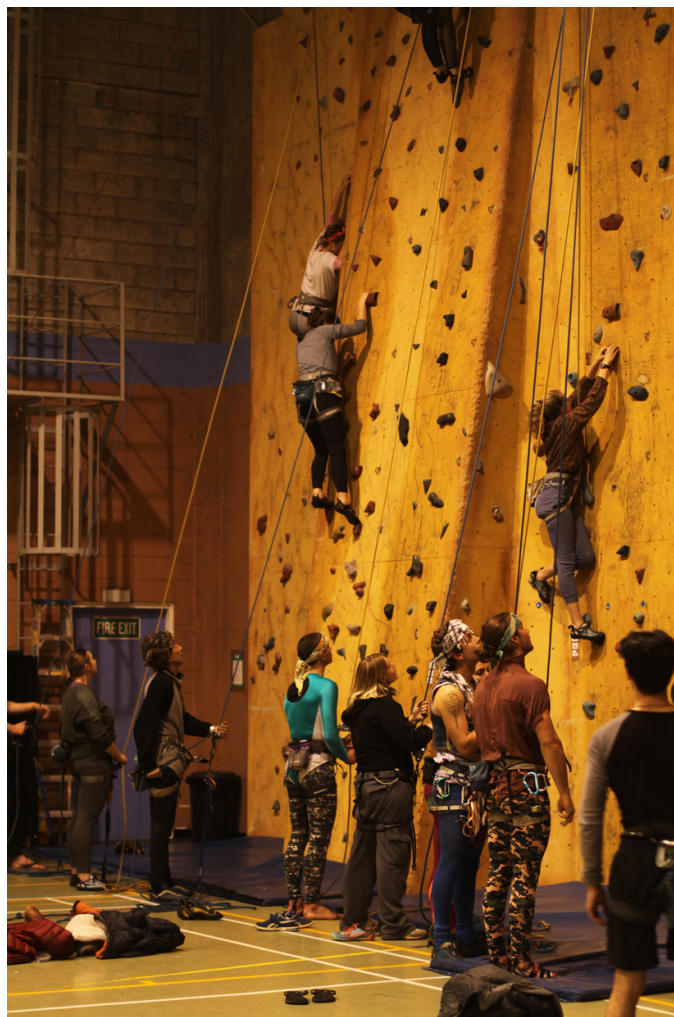
Photo by Paul Caffyn. His caption was, "A night of celebration, some lovely tights on the boys!"